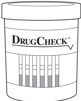
DrugCheck Drug Screen Cup